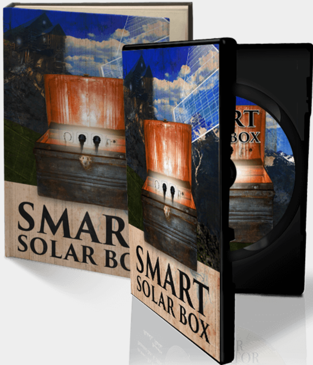
Digital Product. Image For Visualization Purpose Only