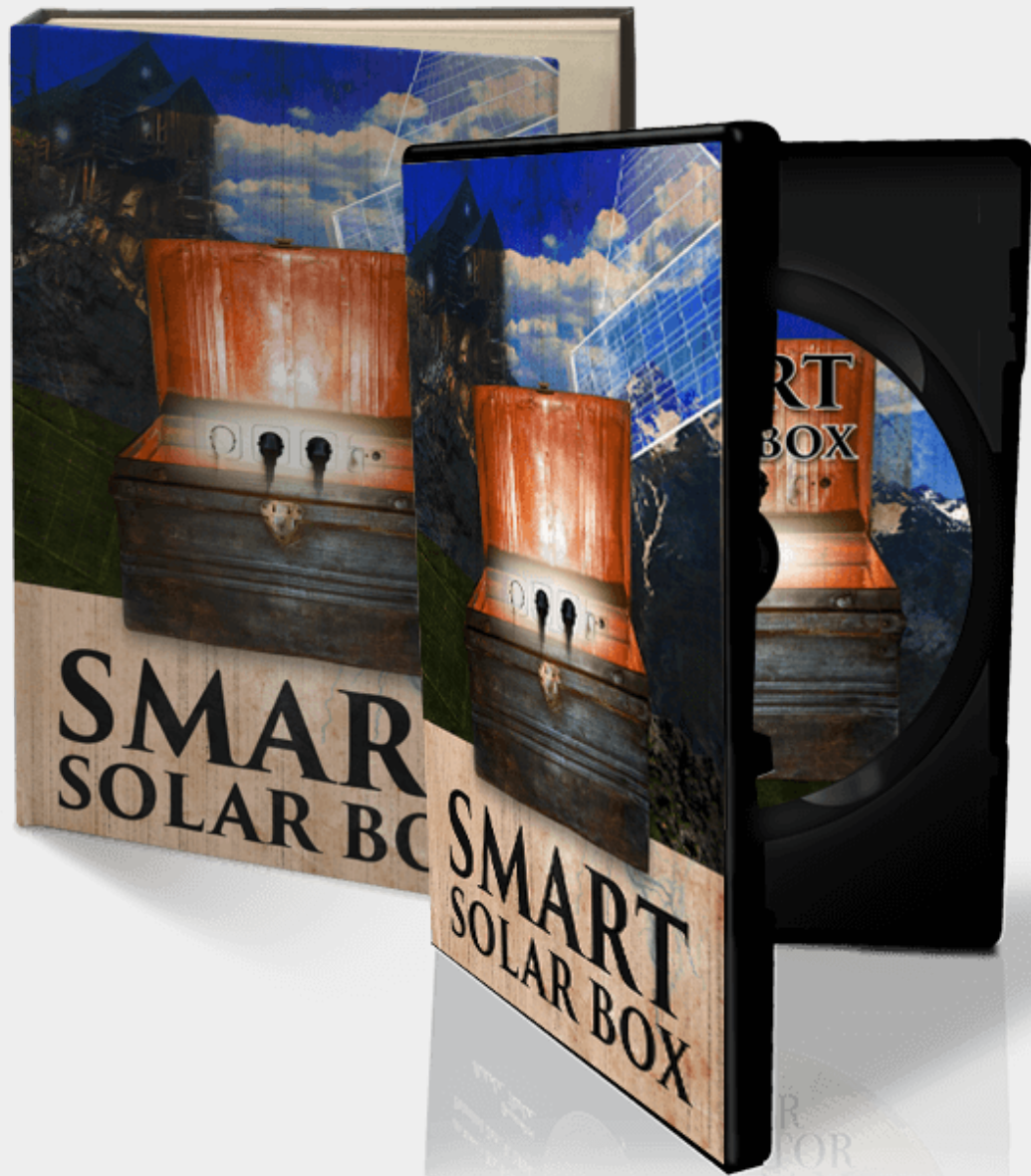
Digital Product. Image For Visualization Purpose Only